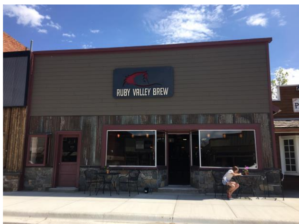
Ruby Valley Brew opened in Sheridan in June 2017.

We often hear the question: Has (insert town name here) reached capacity for breweries? It's obviously just speculation and only time will tell, but it sure has been interesting to watch the number of breweries increase beyond what people thought was possible just five or ten years ago.