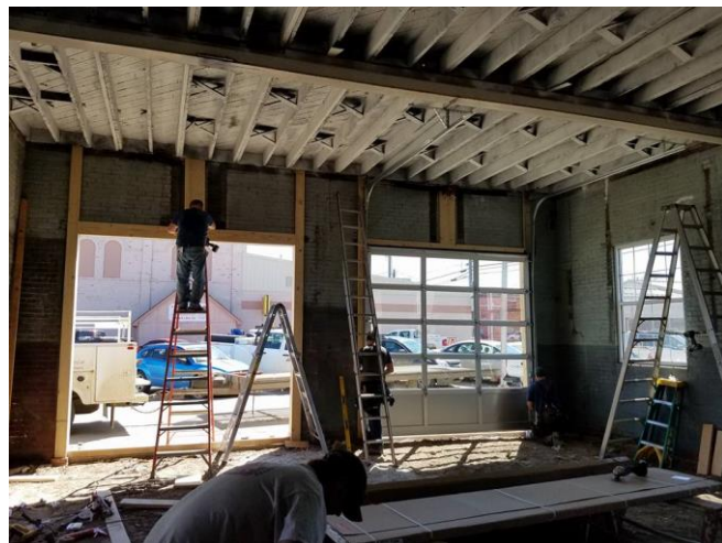
Renovations on an old gas station in Havre – soon to be Old Station Brewing!

There are currently another 14 breweries in planning, showing that Montanans' appetite for craft beer is not waning. We look forward to the addition of the following breweries to the Montana Brewers family.