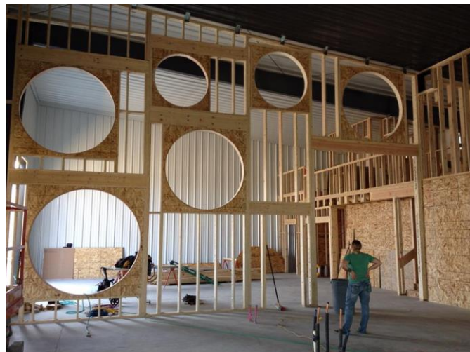
Walls going up at Snow Hop Brewery, coming to Helena in 2018.