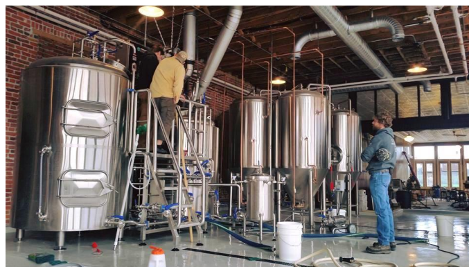
Anaconda welcomed its first brewery when Smelter City Brewing opened in July 2017.

First, a bit of history. In 1968, Great Falls Select closed its doors and so began a Montana beer drought with no breweries in the state. That began to change in 1984 when Kessler Brewing opened in Helena. The brewery used the same name as the historic brewery that operated in Helena from 1865 to 1958. That second edition of Kessler Brewing closed in 1984, but Bayern Brewing filled the void opening in Missoula in 1987. Bayern is now 30 years old and as Montana's oldest operating brewery, marked the beginning of the modern craft brewing era in Montana.