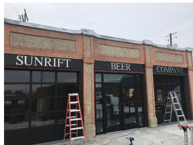
Sunrift Beer Co. in Kalispell, opening Spring 2018.