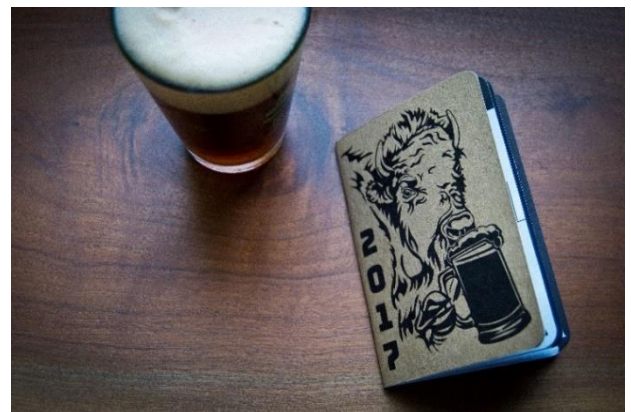
A Snapshot of the #BznBeerWeek Passport

To assist beer lovers on their craft beer week journey, Fermentana has also released the official Bozeman Craft Beer Week Passport. This pocket-sized guide features a full schedule of events and over $100 in special incentives and discounts for passport holders at select sponsoring businesses throughout the week. (cont.)